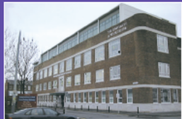
University Dental Hospital