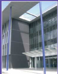
Saint Mary's Hospital