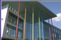
Royal Manchester Children's Hospital