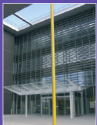
Manchester Royal Eye Hospital