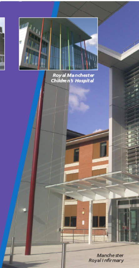
Manchester Royal Infirmary

Central Manchester University Hospitals NHS Foundation Trust Manchester Royal Infirmary Oxford Road, Manchester M13 9WL